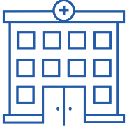
Health systems and hospitals